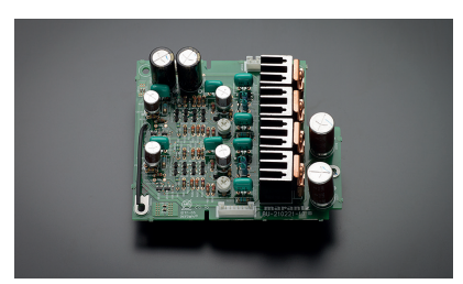
Fully discrete headphone amplifier