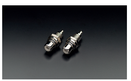
Thick nickle-plated copper output terminals