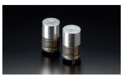
Custom-made Block Capacitors

For music lovers enjoying their favorite recording via headphones, the SA-10 features a high quality headphone stage with dedicated Marantz-own HDAM-SA2 amplifier modules. This unique circuit ensures a high Signal-to-Noise ratio, minimum interferences and an overall rich bandwith music playback. To work with a wide variety of headphones the gain factor can be changed from low to mid to high. It drives low to high impedance headphones effortlessly for the ultimate private listening experience.